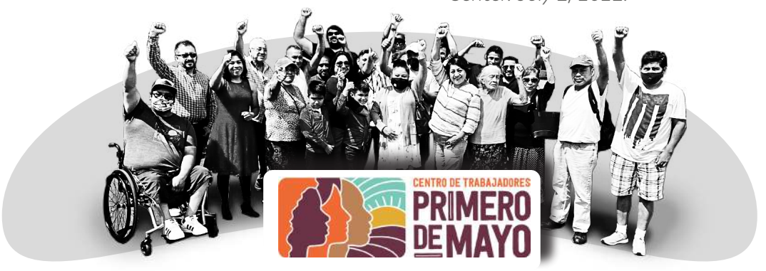
Photo: First worker retreat at the May Day Worker Center. July 1, 2021.

This year, we celebrate the opening of our May Day Worker Center. In a few months, we have organized a committee of 44 people, who will guide our future campaigns. We have helped members of our community obtain more than $170,000 in unemployment and recovered wages. In these difficult times, we have been able to support our community in the fight for their rights.