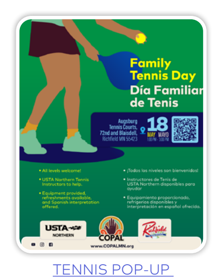
18 de Mayo | 1pm – 3pm Augsburg Park, 7000 Nicollet Ave, Richfield Cost: free